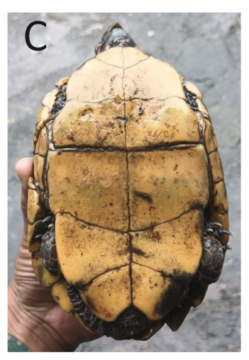
Fig. 2. Coura mouhotii encountered in Doimara Reserve Forest, Arunachal Pradesh—A. dorsolateral view, B. carapace, and C. plastron.